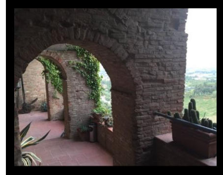
Cloisters and terrace