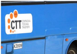
CTT BUS nbr 320

When you get off the train at San Miniato-Fucecchio station, get CCT bus nbr 320 to San Miniato town center and get off in piazza Dante. From here you'll have to walk for about 5 minutes to reach the hostel. The bus frequency is every half an hour (es. 8 a.m-8,30 am and so on) The last bus in the evening is at 8,30 p.m. The bus ticket is 1,50€ .